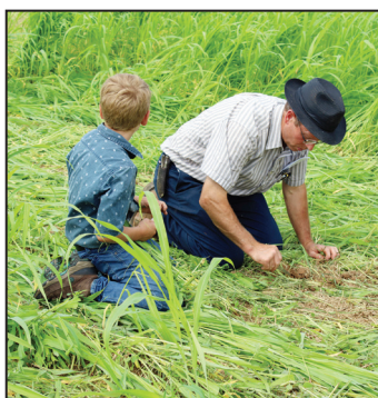
Pictured clockwise from top left: Father and son get a close look at no-till seed placement using soil "dig stick" provided by Horizon Farm Credit. Drone shot of the equipment demonstration at Hershey Farm. The field days received huge support from over 30 vendors and sponsors, each with a display table. A portion of the large crowd in attendance at the eastern field day